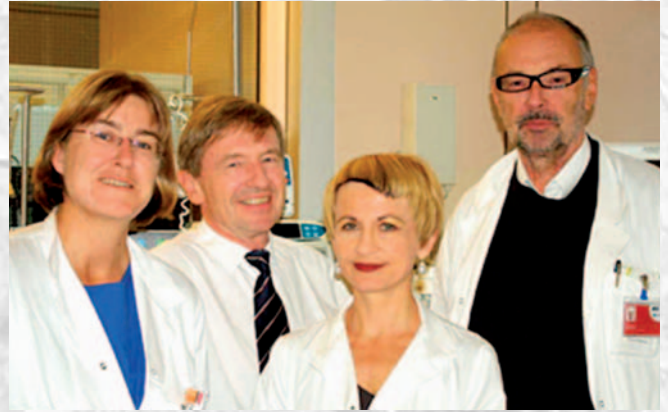
ISFA 2011 – Local Organizing Committee